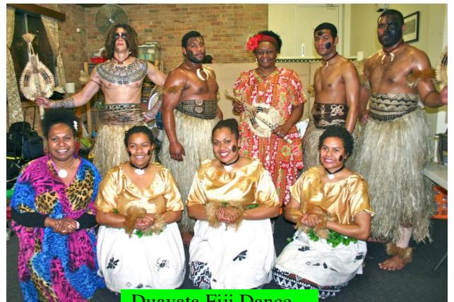
Duavata Fiji Dance ...