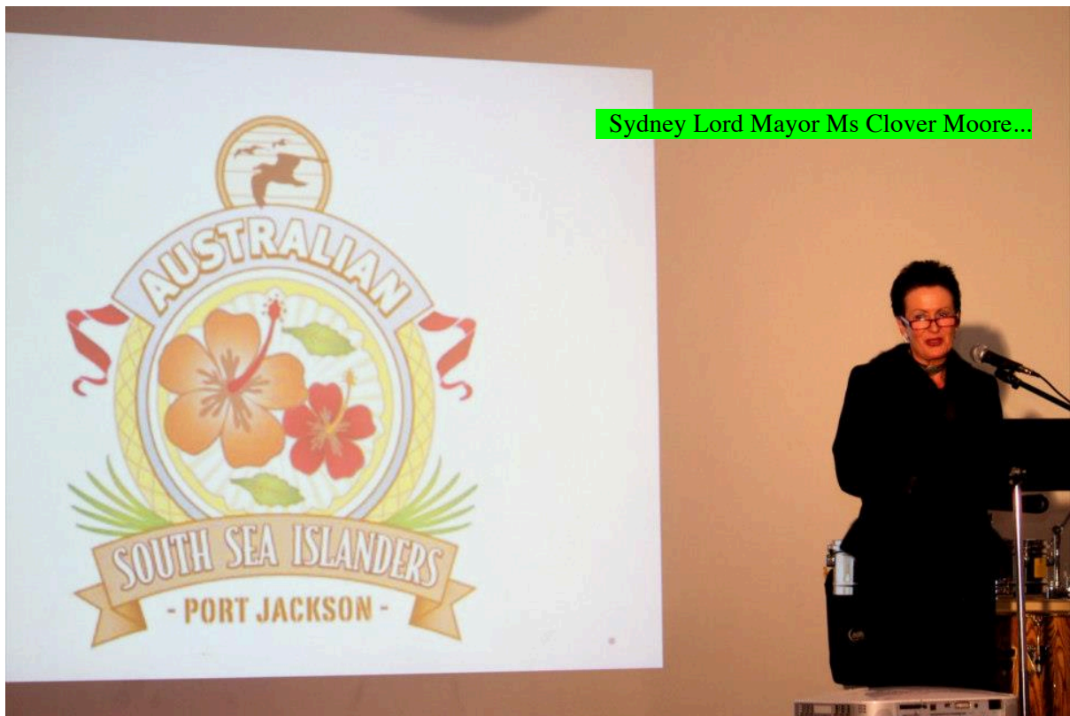
Sydney Lord Mayor Ms Clover Moore...