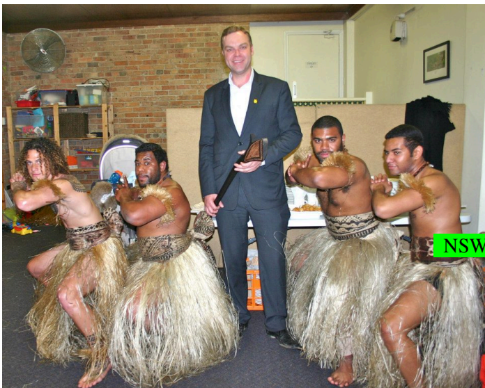
NSW Minister Jamie Parker ...