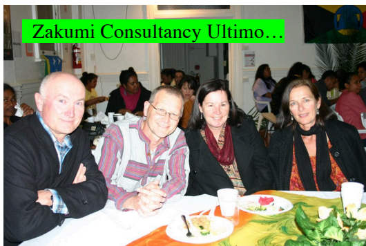
Zakumi Consultancy Ultimo...